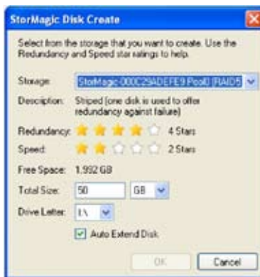
DISK CREATION SETUP FUNCTION

Setting up a new disk is amazingly easy. The SM Series dramatically simplifies setup by consolidating three applications and 20 different steps into a few mouse clicks.