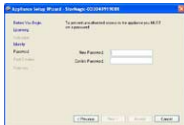
PASSWORD PROTECTION AUTHORIZATION

StorMagic's Windows-based interface is familiar and easy to read. It's also secure—you'll be asked to set a strong password to prevent unauthorized access to the appliance.