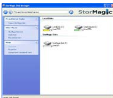
SUCCESSFUL INSTALLATION INTERFACE

The SM Series allows you to move existing data to network storage without disruption to employees. Plus, it “self-manages”—automatically freeing server space and tuning your storage to capacity and performance changes.